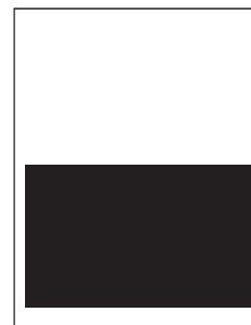
1/2 page horizontal