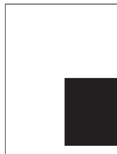
1/4 page vertical