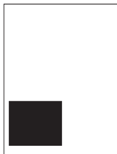
1/6 page horizontal