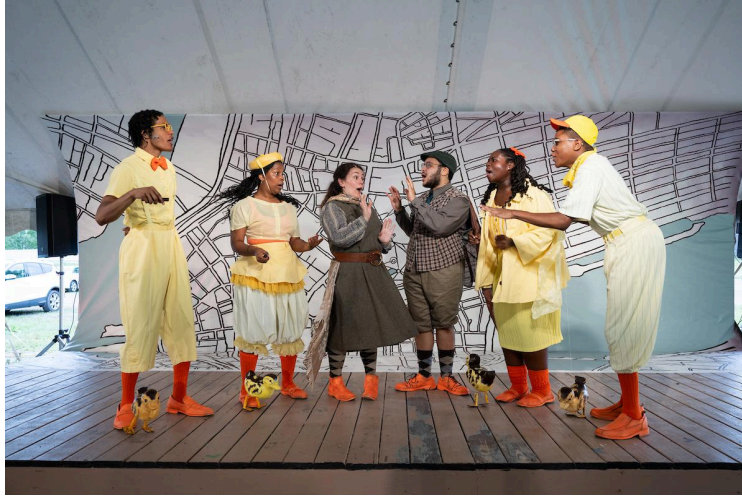
Make Way For Ducklings, 2024

In the early 2000s the Hangar Theatre Design Fellowship program was launched to aid in the development of the next generation of theatre designers, providing an opportunity for intensive hands-on training in a professional, repertory model experience. This program is designed to help bridge the gap between the educational and professional worlds. Hangar Design Fellows have the opportunity to explore, grow, think, collaborate, network, design, stretch, and most importantly – to learn by doing .