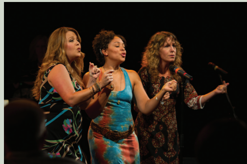
We Carry the Dream performance at Trumansburg Elementary School; 2013 Spring Break-a-Leg performance; Project 4 at Caroline Elementary School; CabarETC performance Back to the Garden.