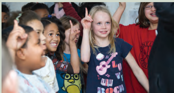
Clockwise from top left: Next Generation School of Theatre, clowning class; Project 4 performance on the Hangar stage; Project 4 in the classroom at Beverly J. Martin Elementary School; KIDDSTUFF performance of How I Became a Pirate .